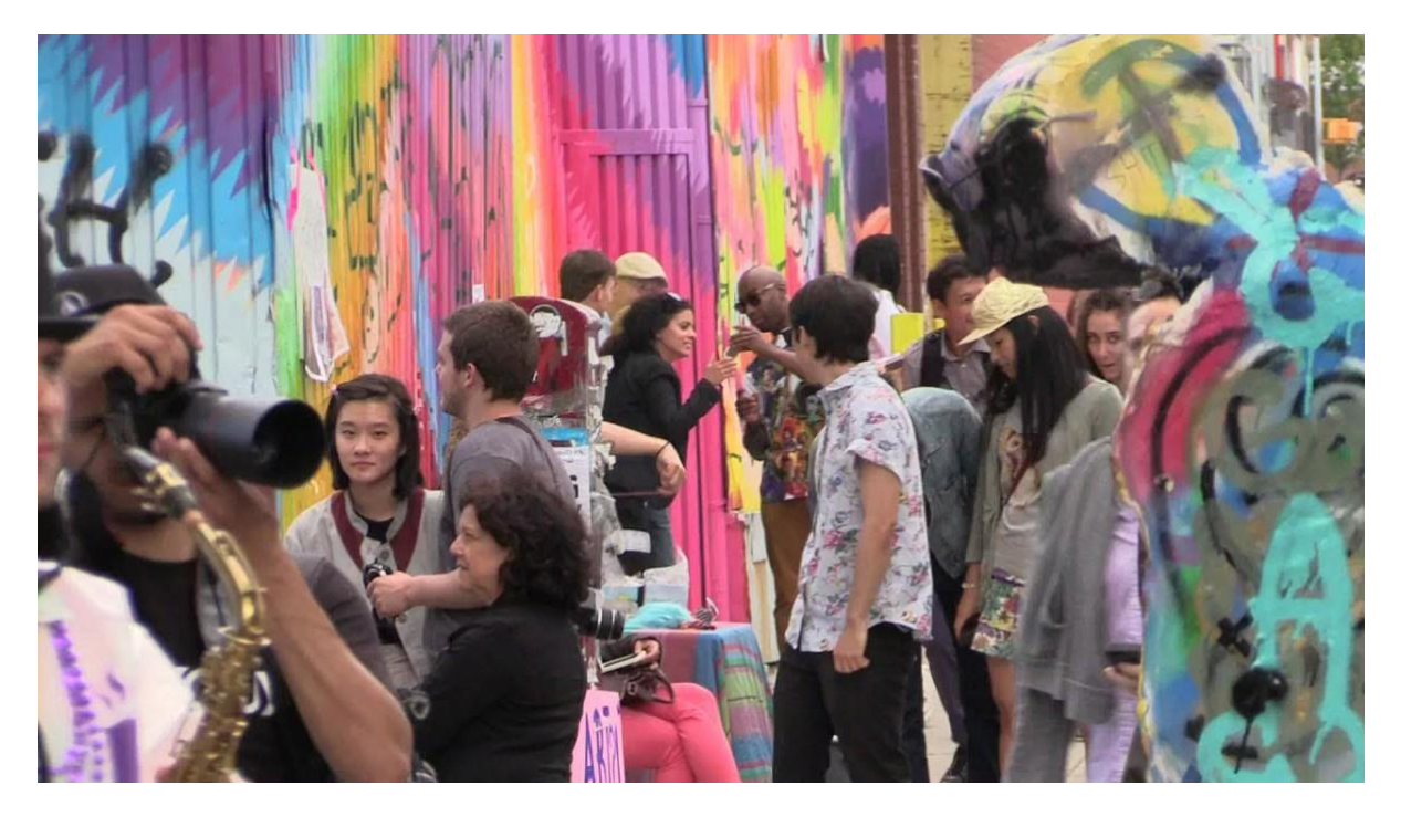
A scene from Bushwick Open Studios 2014.

After nine years, Bushwick Open Studios has transformed from a loose gathering of local art lovers to a massive weekend blowout. Organized by the volunteer organization Arts in Bushwick, the mission is to provide a platform for artists at all levels to share and exhibit their work. (See Forget Chelsea—The 15 Brooklyn Galleries You Need to Know Now and 14 Young New York Art Dealers to Watch.)