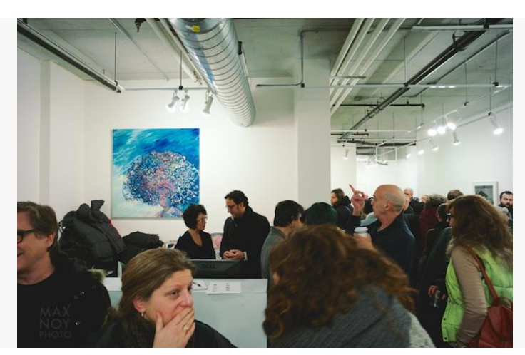
The packed house at Lesley Heller Workspace