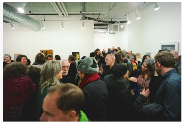
And the messy winter cold could not keep the art lovers away