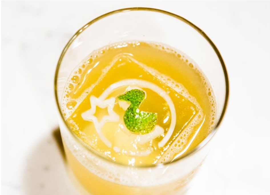
Top: Brain Food cocktail, created in honor of Esther Lev of the Wetlands Conservancy. Bottom: A youth program hosted by the Conservation Foundation of the Gulf Coast helps create future supporters of conservation.