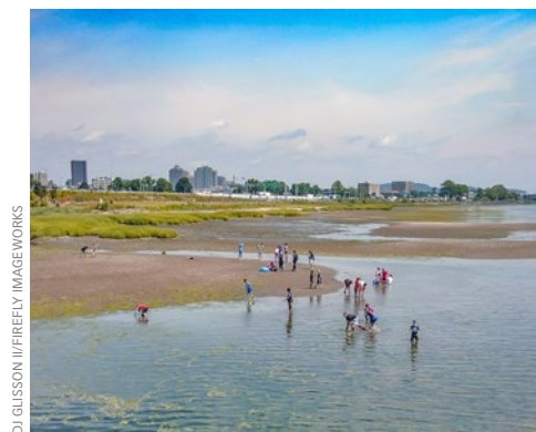
DI GLISSON II/FIREFLY IMAGEWORKS

Climate change is challenging land trusts in many ways, including in stewarding protected lands. Find out how land trusts are managing threats in a systematic way to increase the land's resilience.