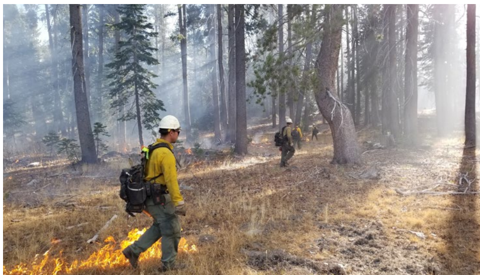
Prescribed burning at The Nature Conservancy’s Independence Lake Preserve near Lake Tahoe in October 2018.