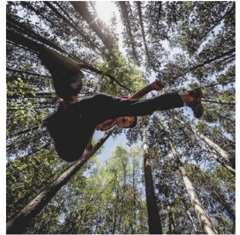
HANSI JOHNSON/MINNESOTA LAND TRUST

“It’s a great story of land protection but also one of a unique compromise by the Federal Aviation Administration, Department of Transportation, Department of Natural Resources, the airport authority