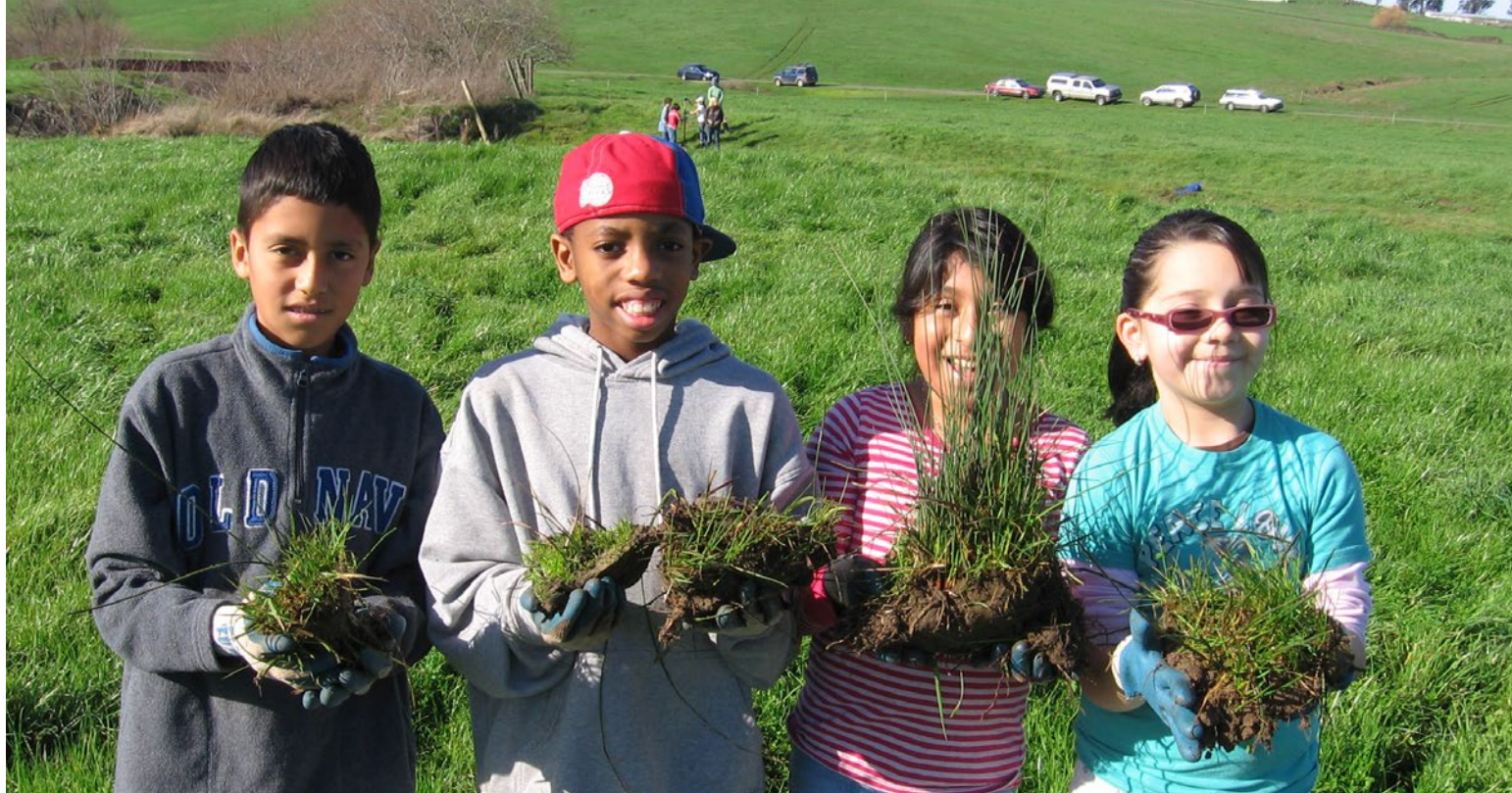
Students from Point Blue's Students and Teachers Restoring A Watershed (STRAW) program help restore creekside habitat on a private ranch. Point Blue is currently testing climate-smart planting palettes in hopes of providing wildlife habitat and food in the face of climate change.

(accredited) in Massachusetts, calls “an absolute horror show.”