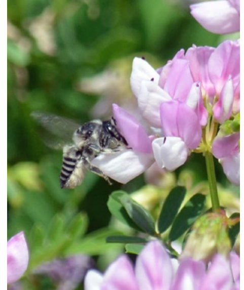
A hairy belly bee gets its name from the specialized hairs, or "scopa," on its underside.

The Xerces Society maintains an extensive website of resources that land trusts can draw from to save pollinator habitat and attract pollinators to protected land. Visit www.xerces.org/pollinator-resource-center for regional information on pollinator plants, habitat conservation guides, nest management instructions, bee identification and monitoring and directories of native pollinator plant nurseries. •