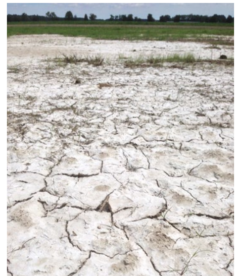
After a series of hot dry days, salt from saltwater intrusion has moved up through the soil profile and precipitated as a crust on the surface of this Maryland farm field near the Chesapeake Bay.

Continued inundation complicates the work of drafting and monitoring conservation easements, and increases the need to ground them in scientific data. Conservation easements prepared by the Maryland Department of Natural