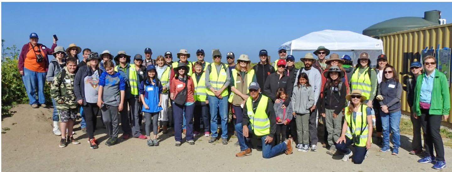
Bioblitz participants at Wavecrest Open Space in Half Moon Bay, California, used the iNaturalist citizen science app to collect information on plants and animals.

None of those restrictions were at play when POST used the iNaturalist citizen science app for a recent “grassroots bioblitz” in collaboration with the Coastside Land Trust and the California Academy of Sciences. The whole purpose of the event, on a publicly accessible property, was to encourage people to use their own phones to observe wildlife and share the results.