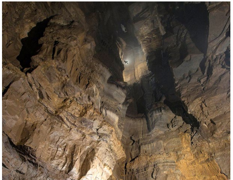
NATIONAL SPELEOLOGICAL SOCIETY