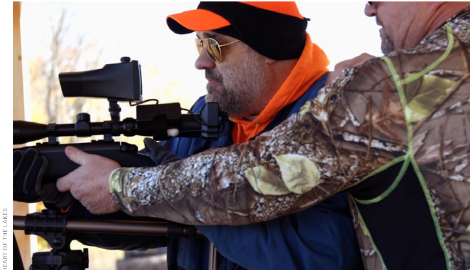
HEART OF THE LAKES

Special equipment was purchased for this blind veteran, who has a guide to set it up for him.