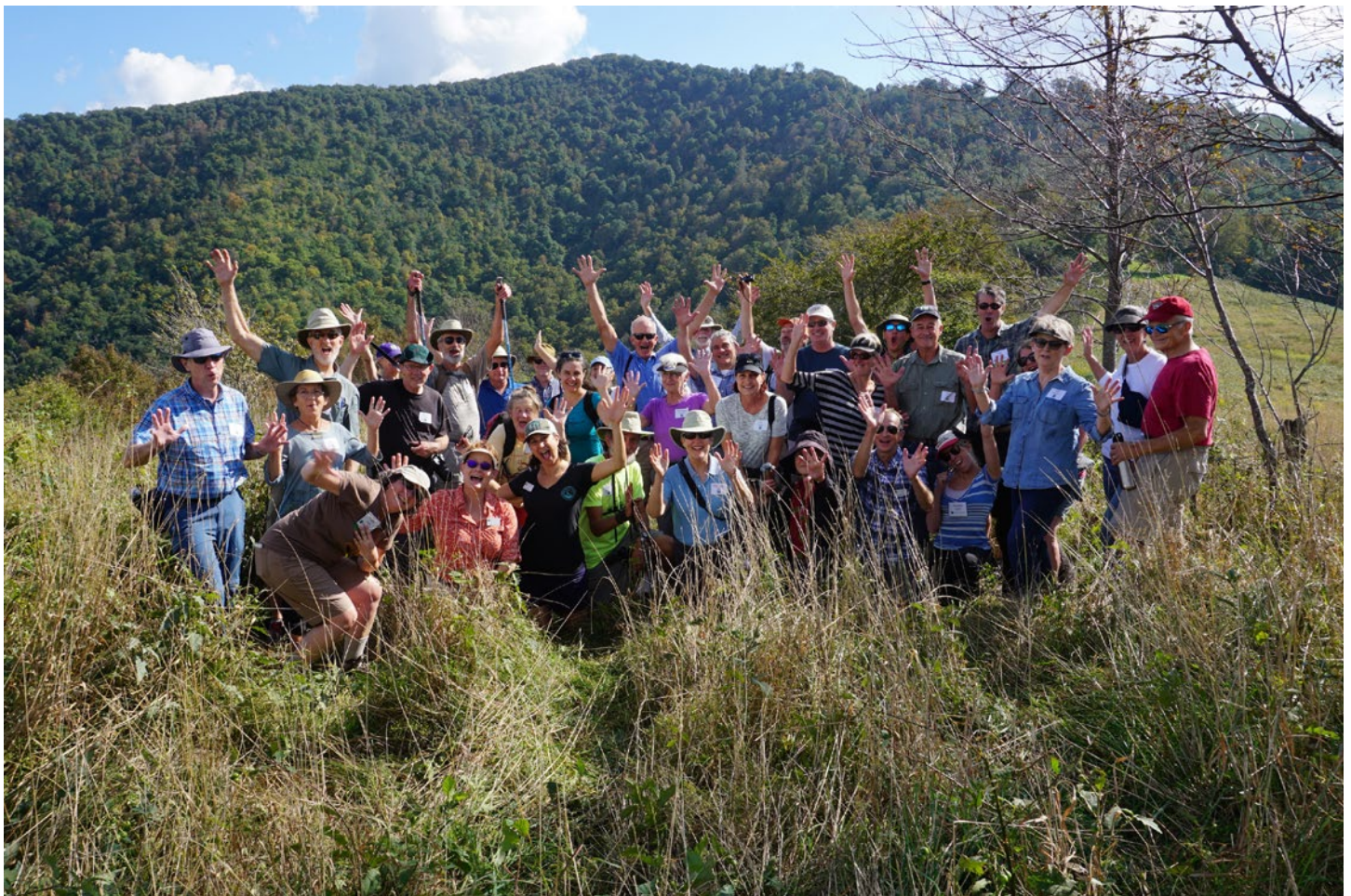
The trustees of the Southern Appalachian Highlands Conservancy celebrate on land their support helped to protect.

some, this marker of success is a litmus test. Foundation funders often ask for confirmation of 100% board giving because they want to know if the entire organization stands behind a proposal. The answer to that question can differentiate a good proposal and a great proposal. It can even make a potential funder walk away.