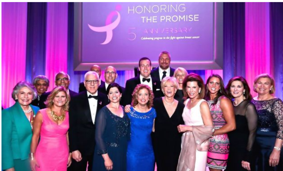
U.S. Rep. Debbie Wasserman Schultz (center in blue)

Susan G. Komen® honored U.S. Rep. Debbie Wasserman Schultz of Florida and Carlyle Group CEO David Rubenstein for their contributions in fighting breast cancer at the fifth annual “Honoring the Promise” gala held at The John F. Kennedy Center for the Performing Arts and raised ‘almost $2 million to fund grants for Komen’s 19 breast cancer grantees in the National Capital Region – an area with the highest incidence of and mortality rate from breast cancer in the nation.’