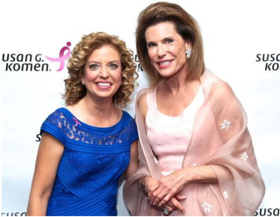
U.S. Rep. Debbie Wasserman Schultz and Amb. Nancy Brinker

cancer,” said U.S. Rep. Debbie Wasserman Schultz (FL-23). “Once I recovered from my own battle against the disease, I knew I had to translate that experience into action by writing legislation with a simple premise: knowledge is power.”