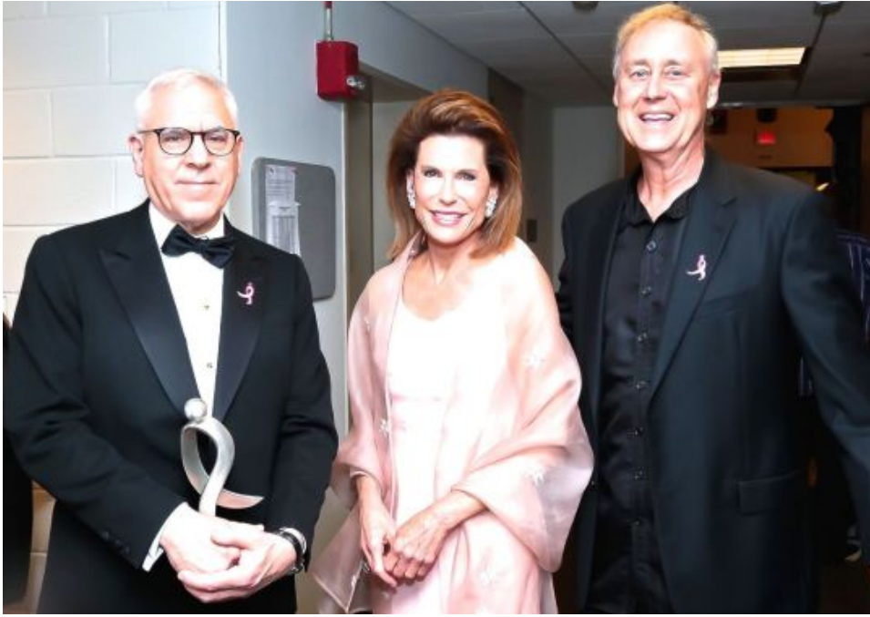
David Rubenstein, Nancy Brinker and Bruce Hornsby