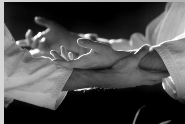
"A Way to Reconcile the World"