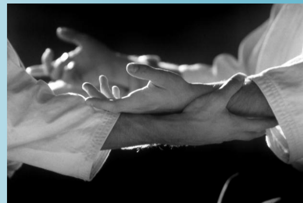
"A Way to Reconcile the World"