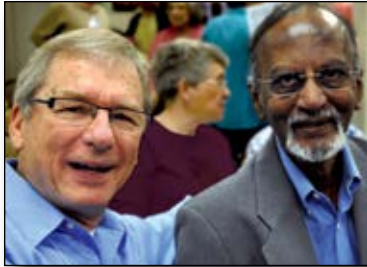
Guidance from mentors