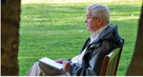
Silence and Reflection

The daily rhythm of the Academy restores a needed balance in our lives. Silence and conversation, rest and relationship — these open our hearts and minds to wisdom and Word.