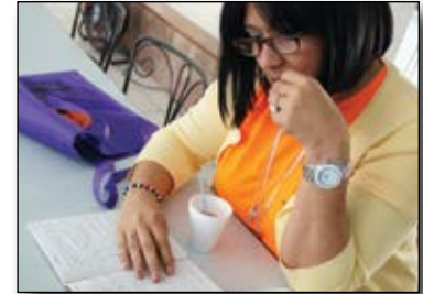
Study and growth