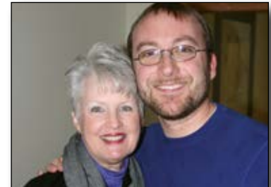
Deepening relationships and community

Between sessions , participants covenant to deepen their spiritual lives through journaling, spiritual direction, directed readings, and care of one's physical body. First and second year covenant commitments provide a focus for one's spiritual growth and a basis for one's engagement with the world.