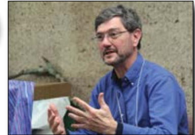
Listening and learning

Between sessions , participants covenant to deepen their spiritual lives through journaling, spiritual direction, directed readings, and care of one's physical body. First and second year covenant commitments provide a focus for one's spiritual growth and a basis for one's engagement with the world.