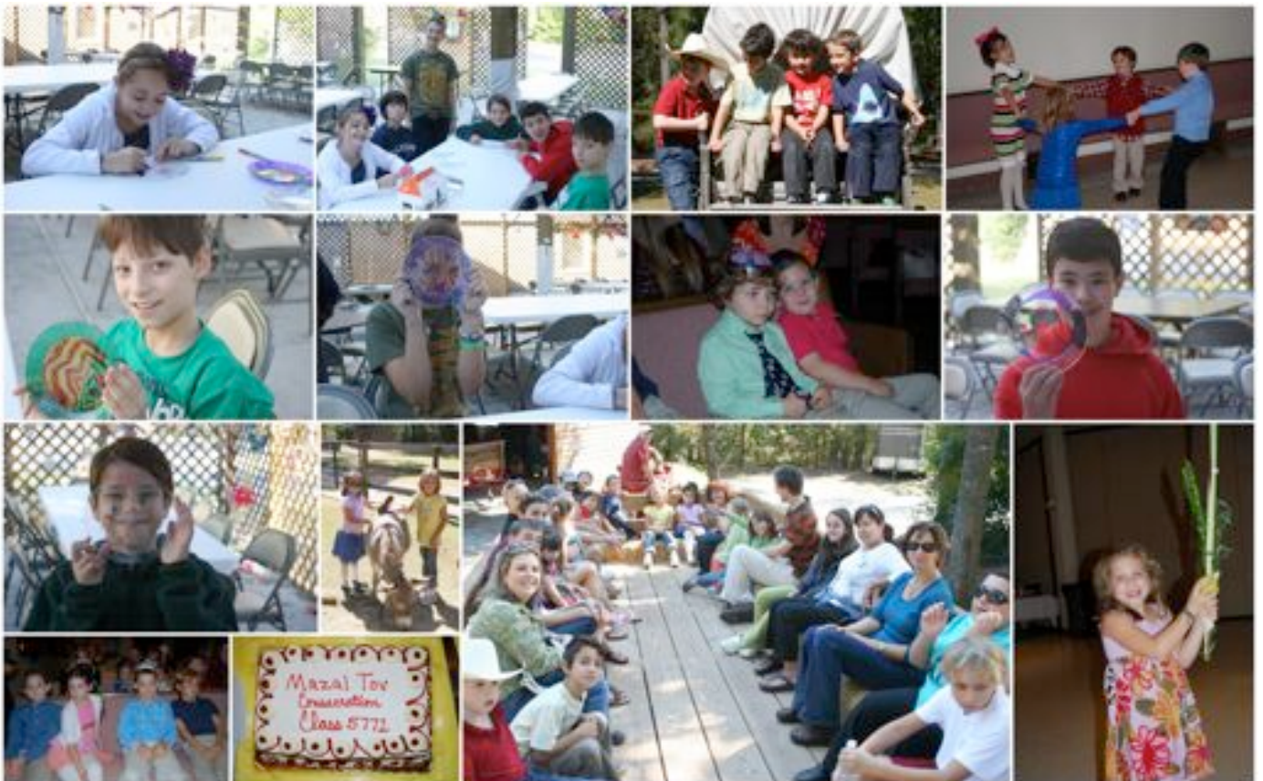
Consecration, Sukkot, and the Pumpkin Patch