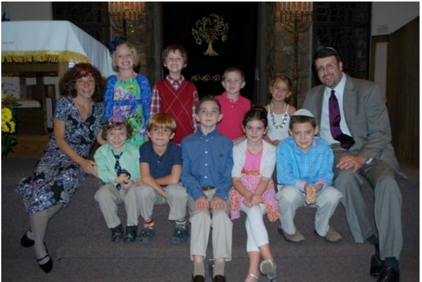
Consecration Class of 5772