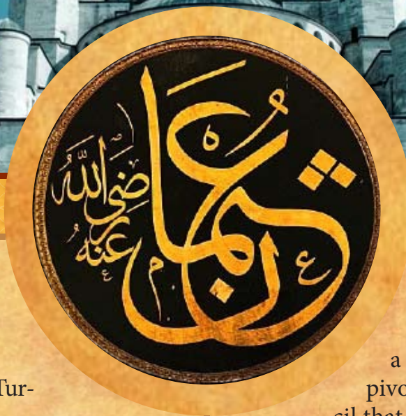
Above: The Hagia Sophia Center: Medallion, from The Hagia Sophia

ISTANBUL/NICEA (May 23 rd –27 th ): We begin in ancient Constantinople, former seat of the Eastern Roman, Byzantine and Ottoman empires, and a once-great capital of the Christian faith. Situated near the Hagia Sophia and the Topkapi Palace, our accommodations at the charming Sirkeci Konak Hotel are in the heart of the old city. On our tour, we will experience ninth and tenth century mosaics in the Hagia Sophia and the Chora Church, visit the Asia side of the harbour to hear a Rabbi's stories of the local Jewish community, and cruise the tranquil Bosphorus in the gap between two continents. Evenings will reveal the exotic cuisine of Turkey at the historic Sarnic Restaurant, Hamdi and other