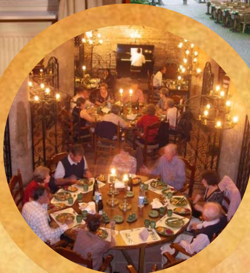
Above Left: Accommodations at the Angleterre Above Right: Outside Café Literature Center: Dining area at the Sarnic Restaurant