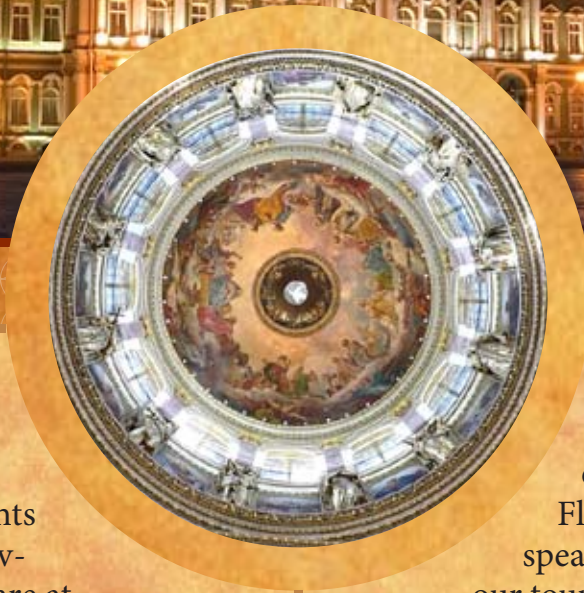
Above: The Winter Palace Center: The central cupola of St. Isaac's Cathedral

BRUGES/BRUSSELS (MAY 31 st –JUNE 4 th ): Our Final Stage takes us to Bruges, via private coach from Brussels airport, where we will stay in the charmed Martin's Orangerie Hotel, located in the heart of the historic city. The capital of Belgium's Flanders province, Bruges is an exemplar nonpareil of medieval architecture, a UNESCO world heritage site, and