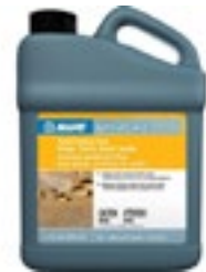
Mapei - Penetrating Plus Stone, Tile & Grout Sealer