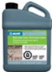
Mapei - Heavy-Duty Stone, Tile & Grout Cleaner