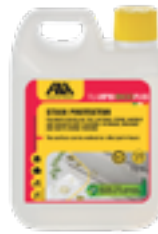
Fila MP90 Eco Plus