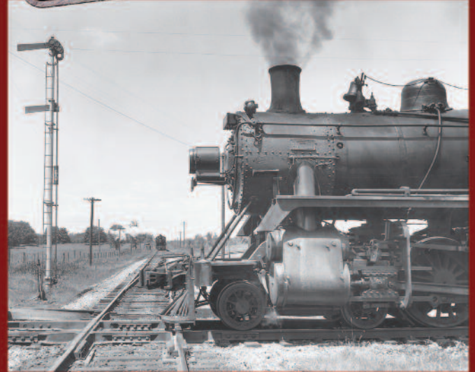
Rehor, Wood & Harwood photograph the branchlines of Ontario

Make sure to set your copy down in a handy spot. Time after time, you'll grab it, settle back and escape to the branchlines of Ontario.