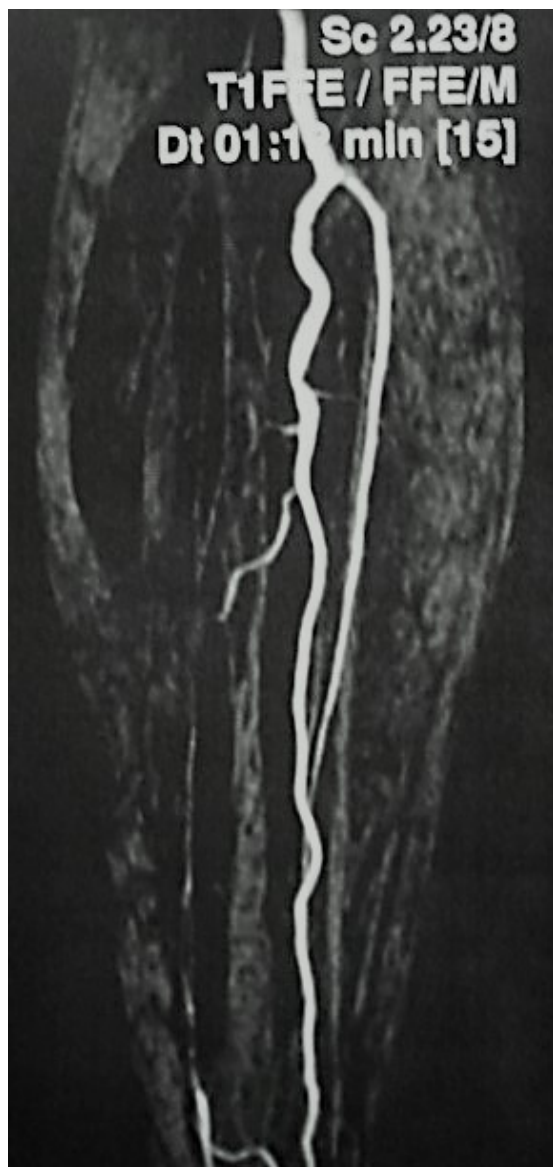
Figure 2. Control magnetic resonance angiography showing no perfusion of the aneurysm sac and a patent fibular artery.

This last group is even rarer because of use of antibiotics and early surgical treatment for bacterial endocarditis and, when they do occur, they tend to affect axial arteries such as the aorta, cerebral arteries, mesenteric arteries, and the common femoral artery more often. 4