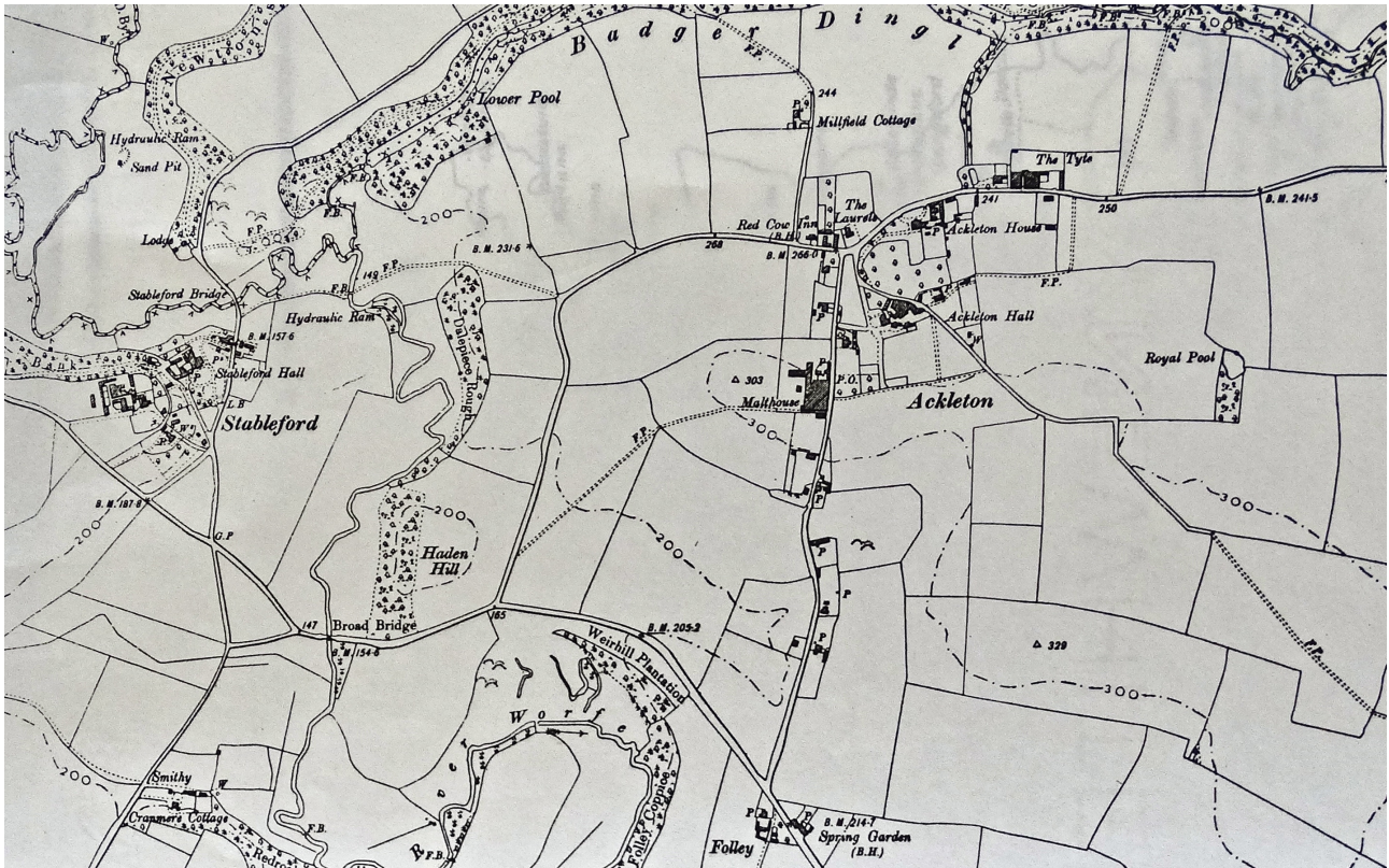
1903 Ordnance Survey map of Ackleton