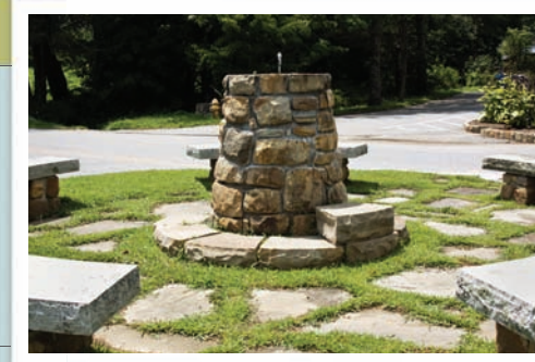
Legend has it: "Drink from the Town Fountain, and you will always return to Crossnore."

creek and forest walk, another CCE project, will be in place, enhanced with step and bridge work as it slices up the hill past lone stone chimneys toward the historic rock beauty of the Crossnore Presbyterian Church.