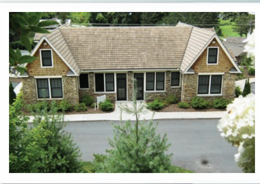
The original Crossnore Hospital building, uncovered and restored to new uses.

With innovative planning, Crossnore School purchased the abandoned hospital and restored its original stone structure, long since hidden by modern additions. After extensive area flooding in 2004, CCE gained a hurricane recovery grant from the NC Rural Center, using those funds to work with the town's council in the repair of water lines, to remodel