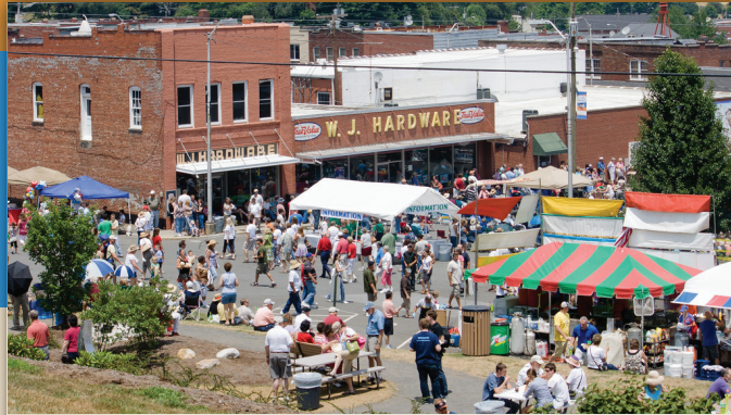
Downtown West Jefferson bustles with an outdoor farmers market where local farmers and artisans go to sell their produce and handmade crafts.