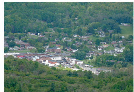
An aerial photo of West Jefferson.