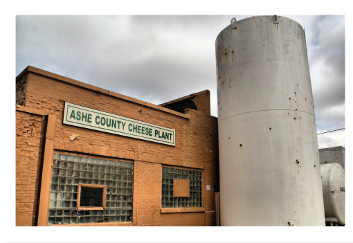
The Ashe County Cheese Plant resides in West Jefferson.

Ashe County Cheese Plant: Established in 1931, the plant located in the heart of downtown remains a big draw for West Jefferson and offers daily tours of the cheese-making operation as well as a retail gift shop.