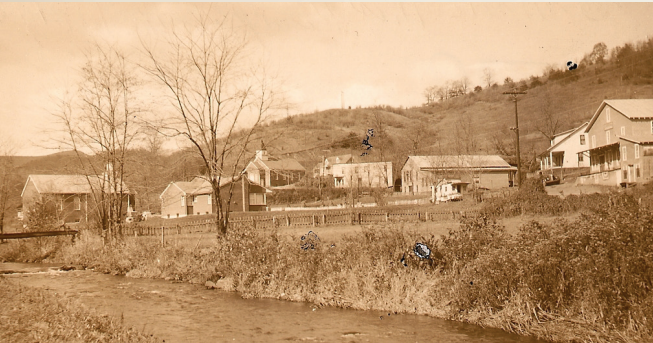
Todd (circa 1954) was a booming town before the Great Depression and afterward lay somewhat dormant until the 1990s.

Todd was established in the early 1800s at the crossroads of two early wagon roads that traversed the mountains of northwest North Carolina. Selected as the terminus of the Virginia Carolina Railway in 1910, Todd soon rose to prominence as a timber boomtown. The railroad brought prosperity and hotels, stores and doctor's offices were built in the bustling valley along the New River. Model T Fords were shipped in from Detroit for final assembly and sale. Mica mines dotted