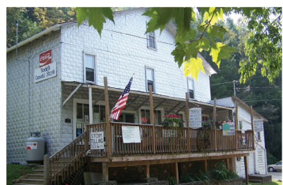
Todd General Store, opened in 1914, remains Todd's most notable landmark through a century of change.

If you're coming to Todd, you don't want to miss what makes it so special: