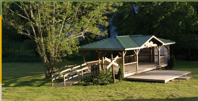
Picturesque Cook Park is the backdrop for community celebrations, concerts and festivals throughout the year.