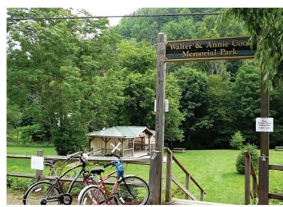
Bicyclists, daytrippers, anglers and bikers all find a place to play in Todd.

Situated in the heart of the community, the park is the setting for community celebrations, summer afternoon concerts and many a family picnic. Jump in the adjacent