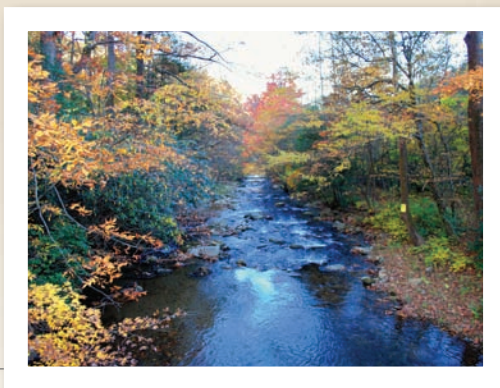
Mill Creek runs through Old Fort from Andrews Geyser and provides an excellent public fishing area for visitors and residents.