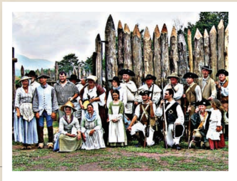
See living history at Davidson's Fort Historic Park where time stopped in the late 1700's.

in 1776 by the North Carolina militia as a part of their defenses against hostile Cherokees. Today, volunteers have replicated the fort at Davidson's Fort Historic Park as a living history site. ( www.davidsonsonfort.com ) The Mountain