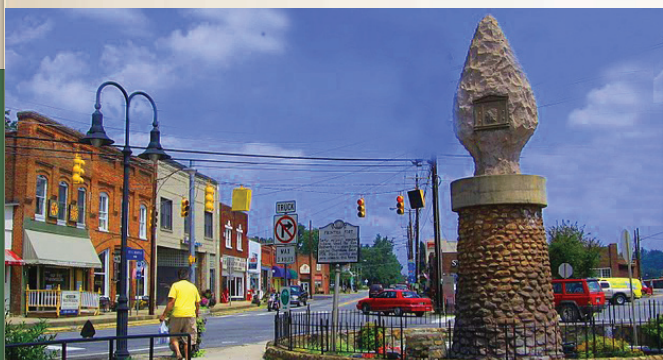
Old Fort has a vibrant downtown full of history and culture. The Arrowhead monument has been standing since 1950.