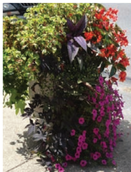
Planter boxes add an accent of beauty to downtown Old Fort.

OFMHA secretary adds, "I believe that being a member of HandMade In America has opened many doors for our town to begin to reclaim the attention it once enjoyed."