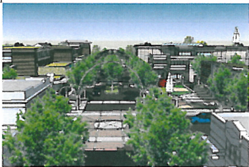
Andrews Gateway Initiative Project Edwin Terrel Meek Architect