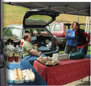
The Madison County Farmers Market is based in Mars Hill. The Good Measure Bakery is one of the many vendors participating in the market.

Madison County Farmers Market: on Saturday mornings, farmers, crafters, visual artists and musicians vendors congregate on Route 213/Cascade Street to share their wares and creations in a good neighbor atmosphere. Among the offerings are locally grown seedlings and the freshest eggs, breads, cakes, honey and home made goat cheese available.