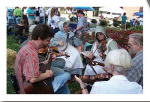
The Bascom Lamar Lunsford Festival is an all-day festival held in Mars Hill during October celebrating regional music and culture.

With its setting of stately brick buildings and spires framed by the misty blue mountains, Mars Hill has the feel of a Norman Rockwell painting. Time seems to slow down, so that the visitor can unhurriedly enjoy attractions such as: