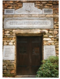
The Rural Life Museum housed in the historic Stone Montague Building, part of the Mars Hill College Campus.