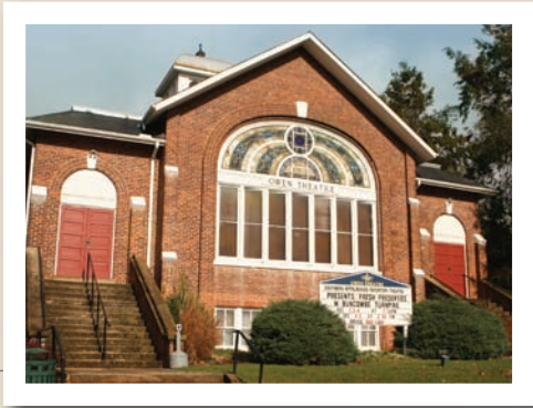
The Owen Theater home of the iconic Southern Appalachian Repertory Theatre