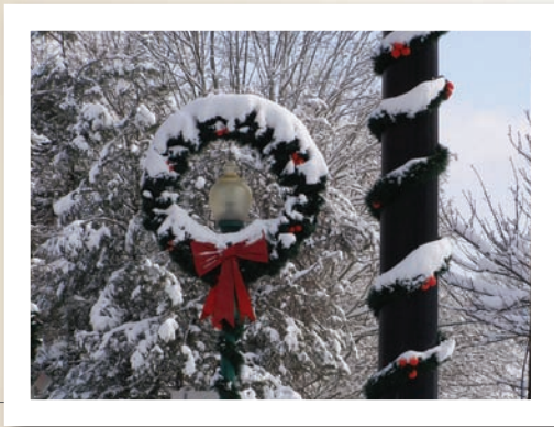
During Christmas time the town of Mars Hill is adorned with beautiful decor.