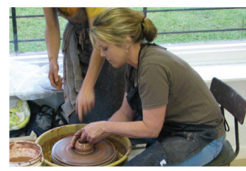
Try your hand at pottery or other artisans' trades.

Art Abounds: The mountains of North Carolina are well known for the inspiration they afford to artisans of all types and the Bryson City area is no exception.