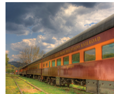
The Great Smoky Mountains Railway takes passengers on a picturesque journey through the Nantahala Gorge.