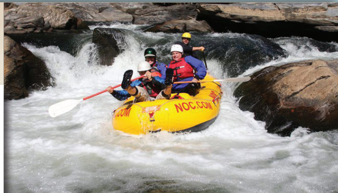
Whitewater rafting on the Nantabala is one of the most popular activities in Bryson City.

Nantabala Outdoor Center: whitewater rafting, kayak and canoe instruction, outdoor school, and adventure travel. Rafting and railroad combo trips.