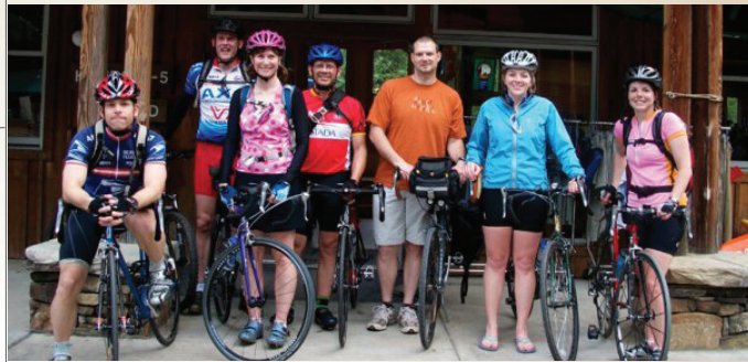
Cycle enthusiasts of all ages and skill sets flock to Bryson City for it's amazing scenery and trails of varying difficulty.

Two National Park entrances, Deep Creek and the ‘Road to Nowhere’ along the north shore of Fontana Lake, are just minutes from town. Several outfitters who offer a mile of whitewater tubing can be found along the way to the Deep Creek entrance. Within the Park, hikers choose from several loop hikes leading to the waterfalls and mountain bikers take advantage of one of the few park trails where bicycles are permitted. Fishermen and picnickers have options here as well. Nearby Fontana Lake provides the only access, other than a multi-day hike,