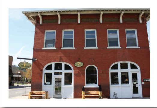
A popular local meeting place, the Cork and Bean is a wine bar and coffee house, located in a 1905 building which originally housed a bank.

Bryson City, seat of Swain County, was built on the site of the Cherokee Indian village known as Younaahqua, or