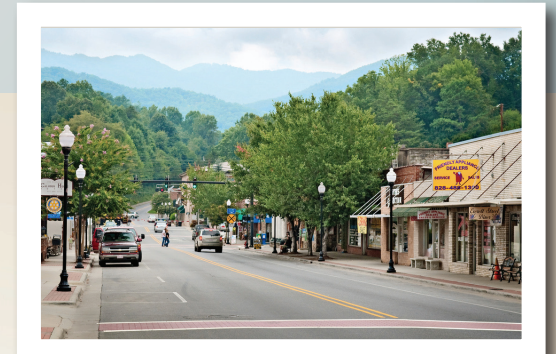
Everett Street: New Sidewalks lampposts, benches, trees and pavement were installed.

is to stop in at the Chamber of Commerce, and pick up the brochures that organize it all by subject: Deep Creek Guide and Map, Shopping Guide, Fishing Guide, Lakeview Drive, Water Activities, Restaurant Guide, Waterfalls Day Trip Guide. Inclement weather? No problem, even rainy days are covered by their Rainy Day Activities Guide.