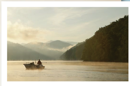
The Fontana Lake provides access to some of the remote areas of the Great Smoky Mountains National Park. A wide range of fish can also be caught on Fontana Lake.

fishing, boating and water skiing. Access to remote areas of the Great Smoky Mountains National Park.