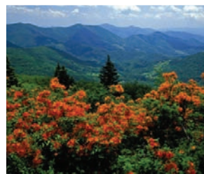
In June, Roan Mountain puts on a spectacular display of Rhododendron in full bloom.

the world's largest natural Catawba Rhododendron gardens. Over 600 acres of rhododendron thickets