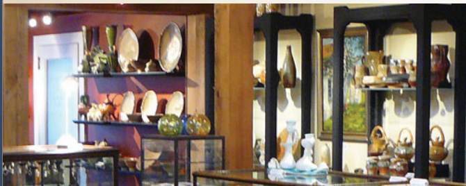
Inside the Crimson Laurel Art Gallery, visitors can find amazing local ceramics and glass that can't be found anywhere else.