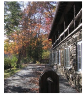
The Penland school has been instrumental in fostering the arts in Bakersville.