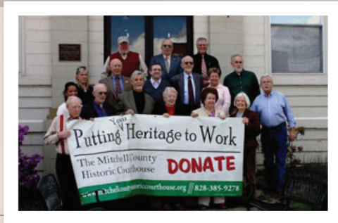
Mitchell County Historic Courthouse Foundation Board of Directors Kick off Public Capital Campaign.

43 Buildings Renovated and 30 facades redone.