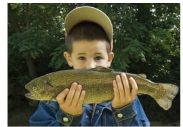
The Troutacular Festival held in Bakersville is made specifically for kids to enjoy the thrill of Trout fishing.

Fishing: Bakersville offers many options for fishermen, young or old. Cane Creek is one of North Carolina's Mountain Heritage Trout Waters. (Ncwildlife.org).