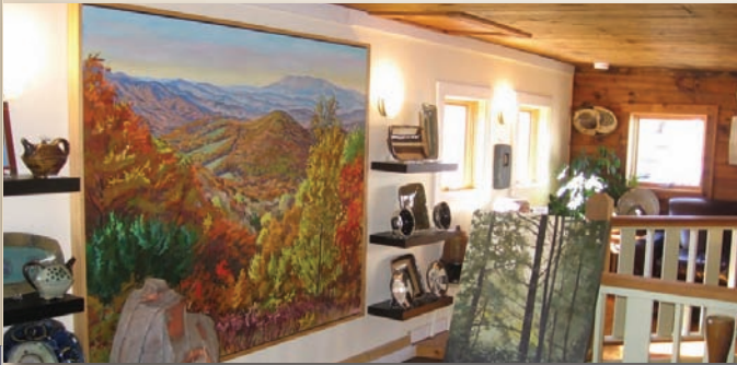
The Crimson Laurel Gallery plays host to a vast array of local art works from paintings & photographs, to ceramics & furniture.