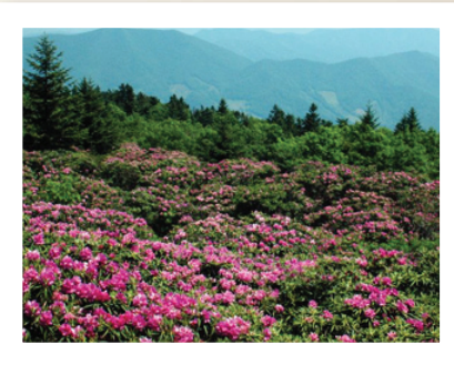
North Carolina Rhododendron Festival: two day festival featuring 10K run, street dance, crowning of the Rhododendron Queen, Creek Walk Arts Festival, car show, ducky derby and other creekside and downtown events. (bakersville.com/rhod-events)

Festivals, such as the Troutacular for kids aged 0-16 in June, and the BAIT (Bakersville Adventures In Trout Fishing) in October provide venues for arts, crafts, outdoor education, music, games and food. Don't know how