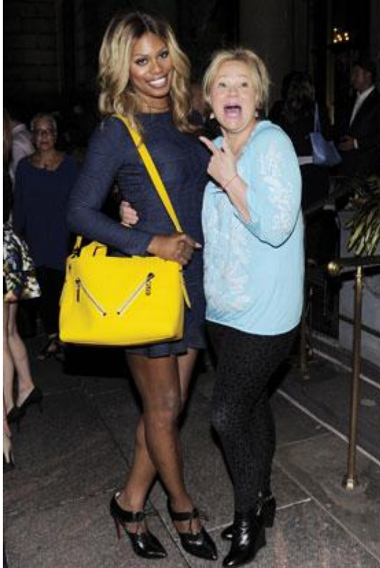
Laverne Cox and Caroline Rhea.