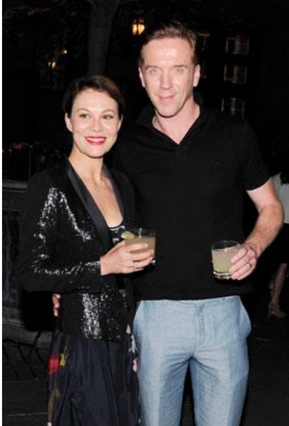
Helen McCrory and Damian Lewis.