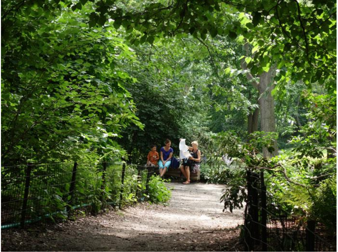
Navigating through Central Park. 3:30 PM.

Monday, July 20, 2015. A weekend of some sunshine, some rain and relentless heat and humidity where the temp at 84 degrees had a “Real Feel” of 102. Not conducive to anything other than maybe a good book sitting in a highly air-conditioned room.