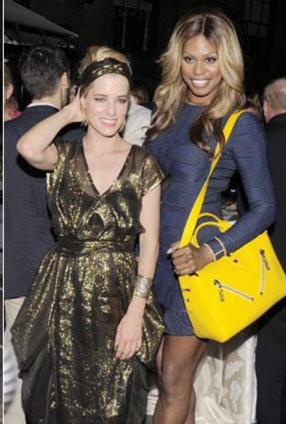
Parker Posey and Laverne Cox.