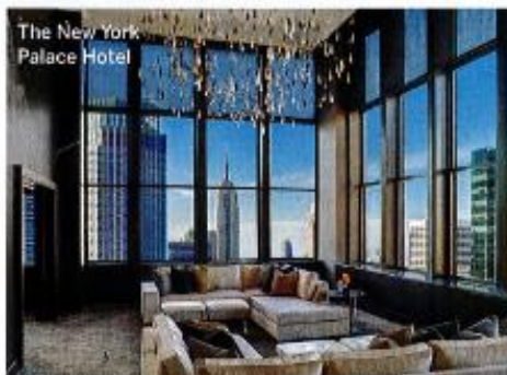
The New York Palace Hotel