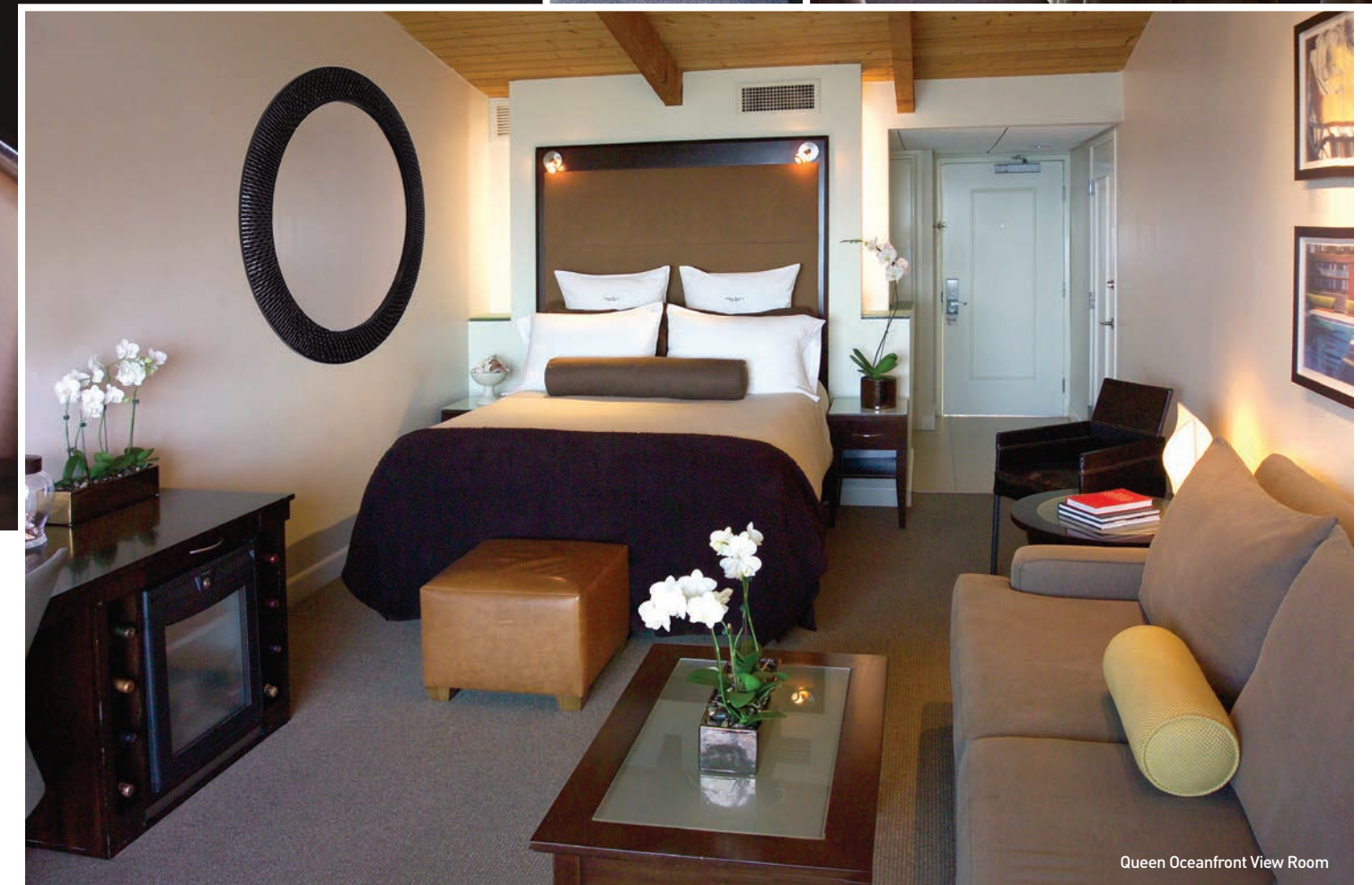
Queen Oceanfront View Room

Malibu Beach Inn, 22878 Pacific Coast Highway, Malibu, CA 90265. For more information, please call us at 310.456.6444 or visit our website at www.malibubeachinn.com