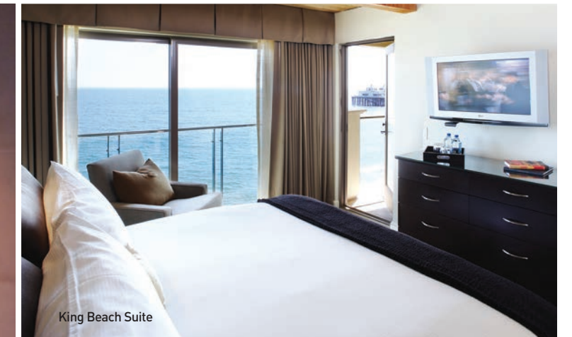
King Beach Suite