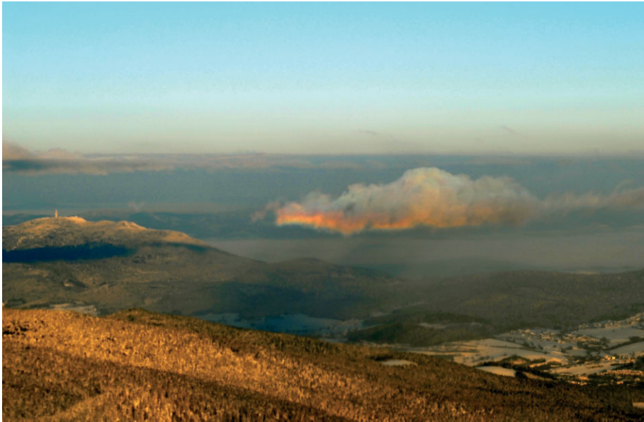
Figure 6. Iridescent clouds near the shadow point, photographed by Stefan Rubach from the mountain Grosser Arber (1456 m; 49° 6.7' N, 13° 8.1' E) in the Bavarian Forest on 26 January 2007, 0852 UTC.