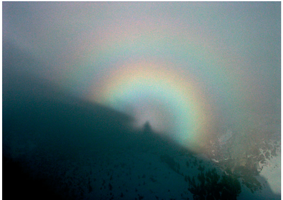
Figure 1. Glory on a fogbank close to the observer, photographed by Claudia Hinz on the mountain Wendelstein (1835 m; 47° 42.2' N, 12° 0.7' E) in the Bavarian Alps on 14 April 2006, 1546 urc.

The diameter of the glory is inversely proportional to the size of the droplets. In