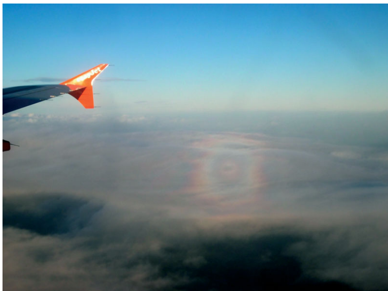
Figure 3. Deformed glory, photographed by Philip Laven on a flight from Geneva to London on 12 July 2006.