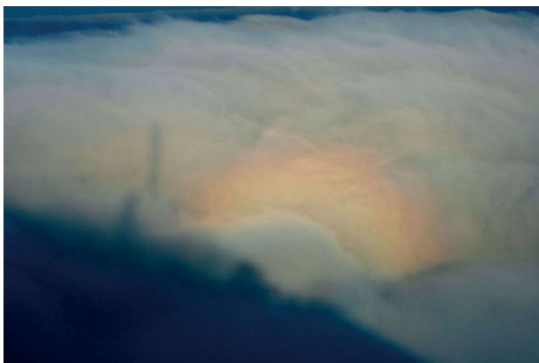
Figure 4. Discontinuity in a shadow of a TV tower cast on an uneven cloud deck, photographed by Claudia Hinz from the mountain Wendelstein in the Bavarian Alps on 18 August 2007, 1619 UTC.