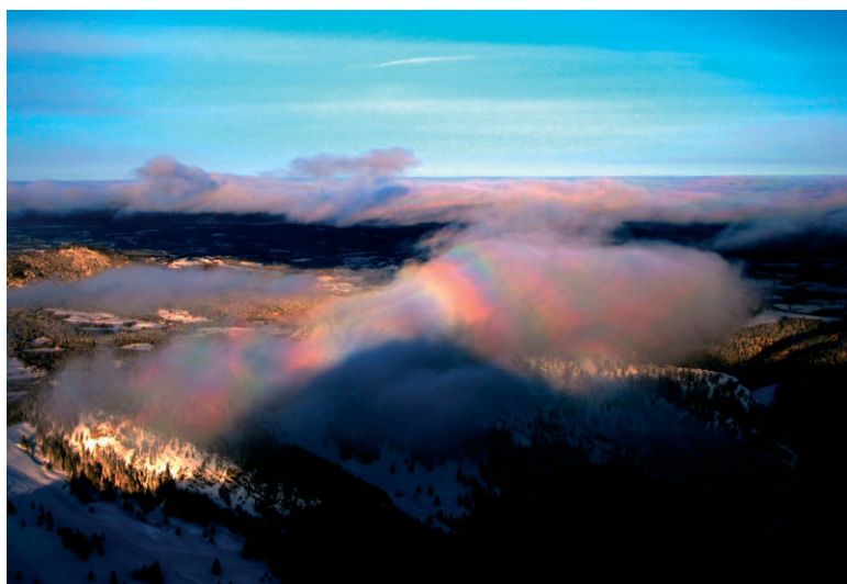
Figure 5. Glory on a cloud cap over the top of a neighbouring mountain. The gradients in droplet size cause the formation of coloured legs running away in seemingly random directions from the circular part of the glory. The sun's elevation is low and the mountain from which the picture was taken casts a triangular shadow. The picture was taken by Claudia Hinz from the mountain Wendelstein (1835 m) in the Bavarian Alps on 18 November 2007, 0726 UTC.

nearby fog, the glory is usually almost perfectly round because the droplets in which the glory appears tend to be uniform in size. But if the glory is formed in distant droplets, its shape may deviate considerably from the circular. This occurs when the droplet size varies significantly along the coloured rings. This may result in elliptical or even angular deformed glories (Figure 3). Strong and sometimes conflicting perspective effects may occur if there are irregularities in a cloud deck resulting in discontinuities in shadows of nearby objects (Figure 4).