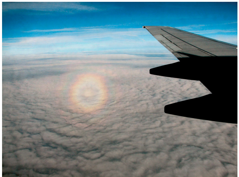
Figure 2. The glory around the shadow point of a plane. The shadow itself is invisible because of the large distance to the cloud deck. The picture was taken by Armin von Werner on a flight from Tampere (Finland) to Frankfurt on 27 August 2005.