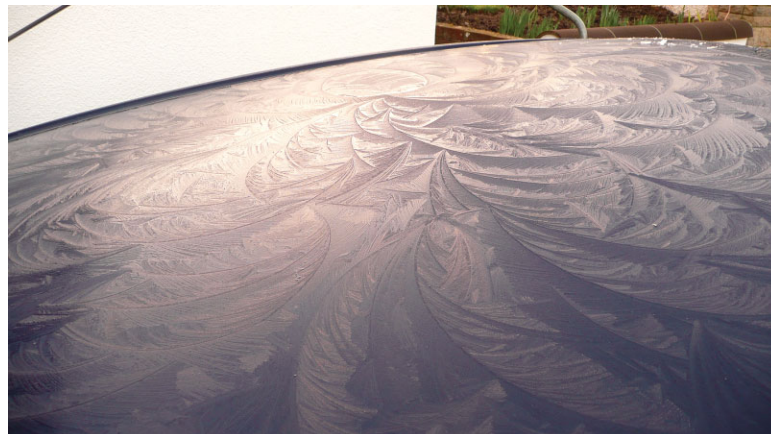
Ice patterns formed on a car roof in Sidmouth, Devon on the morning of 30 January 2008.

Van de Hulst HC. 1947. A theory of the anti-coronae. J. Opt. Soc. Am. 37 : 16–22.