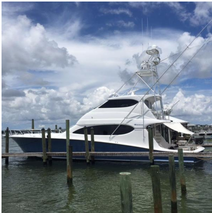
Port at dock - July 2016