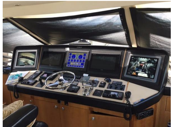
Helm - July 2016