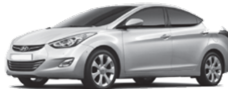
All New 2013 Hyundai Elantra