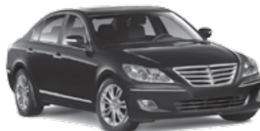
2013 Hyundai Genesis Sedan

**Must present Military ID at time of purchase.