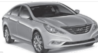
2013 Hyundai Sonata