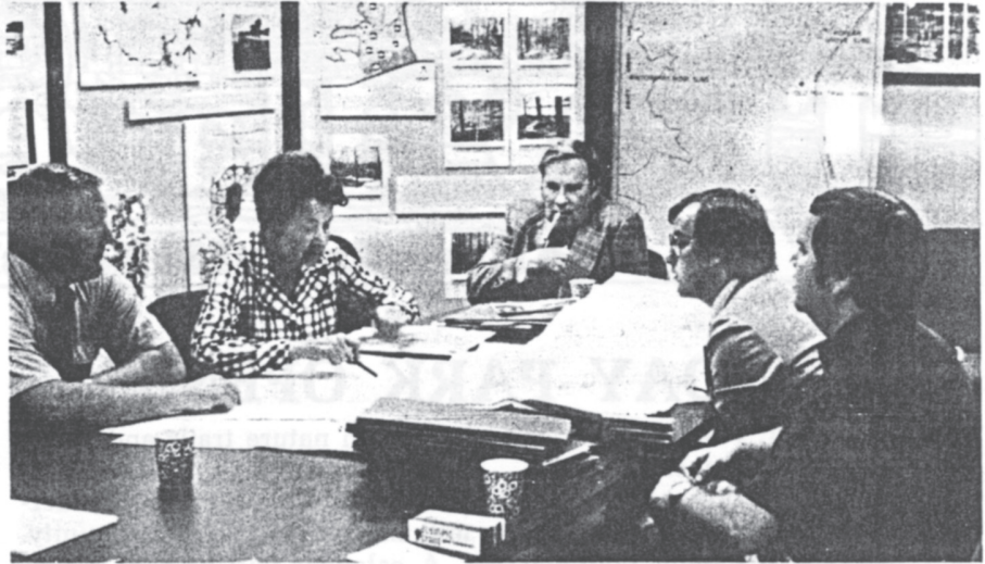
Architectural Review Board studies tenth set of house plans submitted.