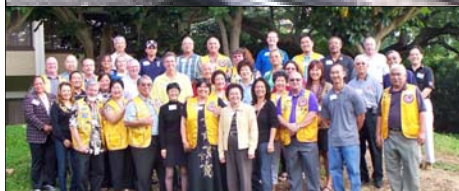
2010 Lions Leadership Institute