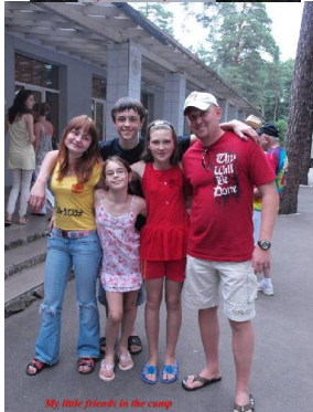
My little friends in the camp