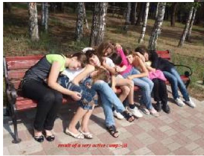
result of a very active camp:-))