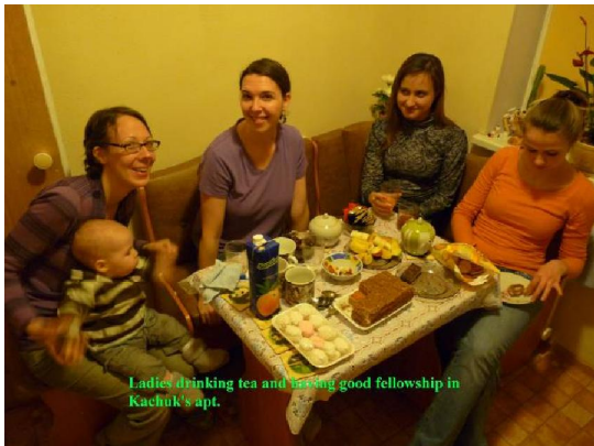
Ladies drinking tea and having good fellowship in Kachuk's apt.