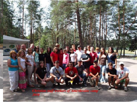
Christianity workers of Amerikraine camp 2009