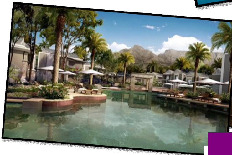
One & Only Cape Town