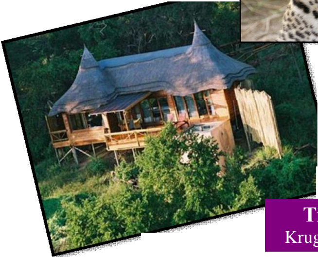
Tinga Narina Kruger National Park