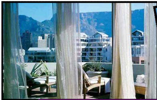
Cape Grace Cape Town