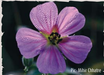
Pic: Mihir Chhatre