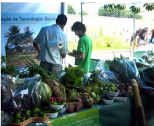
The “Sabores e Saberes” fair. Various cooperatives and farmers in the State of Rio de Janeiro had exposed its products.