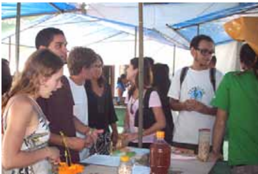
Students visiting the “Sabores e Saberes” fair.

INDIA Sustainability in Design: NOW! Lens the Learning Network on Sustainability