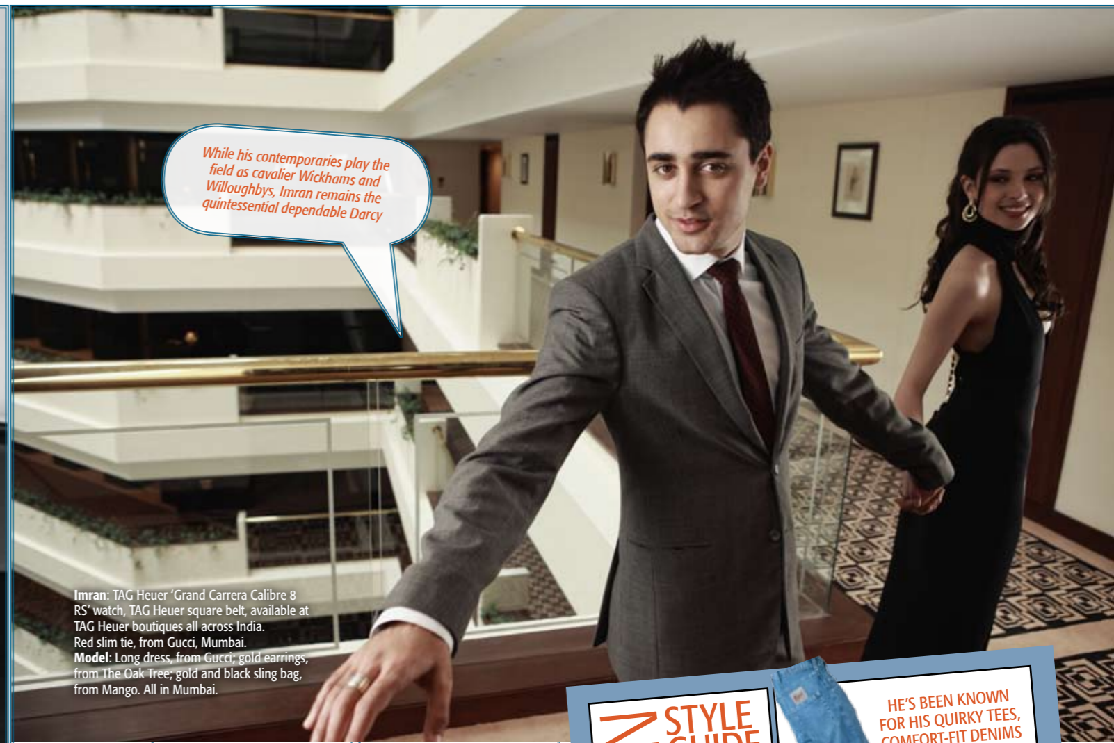
TAG Heuer 'Grand Carrera Calibre 8 RS' watch, TAG Heuer black leather jacket, available at TAG Heuer boutiques all across India.

While his contemporaries play the field as cavalier Wickhams and Willoughbys, Imran remains the quintessential dependable Darcy