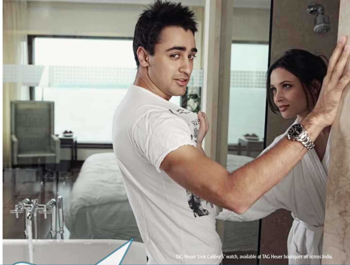
TAG Heuer 'Link Calibre S' watch, available at TAG Heuer boutiques all across India.

"Who knows what makes you sexy? I think my personality works for me – people like me when they meet me. I am an amiable, easy-going person."