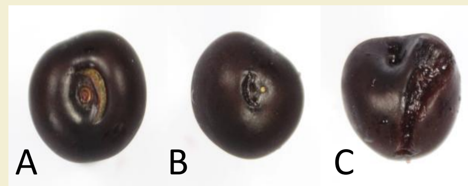
A = Stem-end, B= Apical-end and C = Side crack

Varietal differences in cracking susceptibility have been seen in Tasmania. In addition, varieties seem to be predisposed to crack in particular ways.