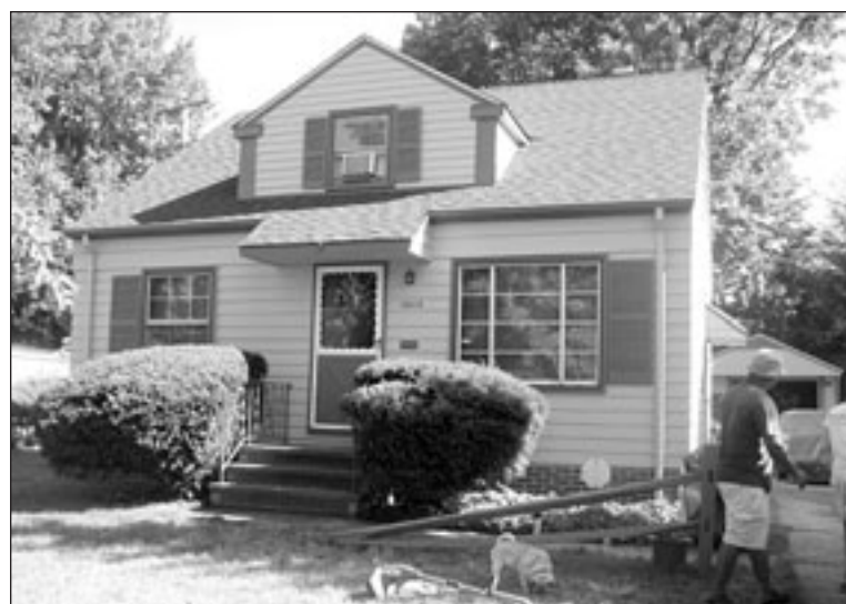
The Collinwood home painted this summer by UCUMC volunteers for Rebuilding Together Cleveland