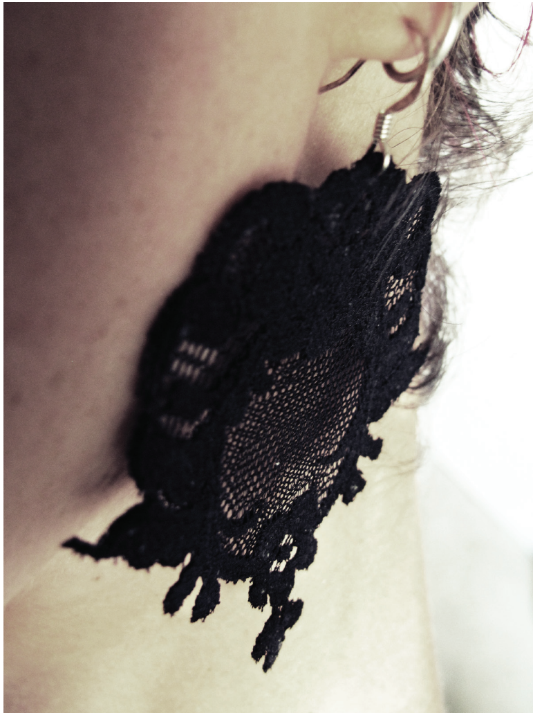
Lace Earring Tutorial