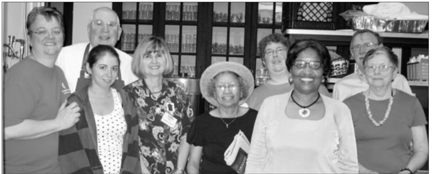
The crew UCUMC and Berea UMC that manned the Neighborhood Lunch on Sunday, May 29