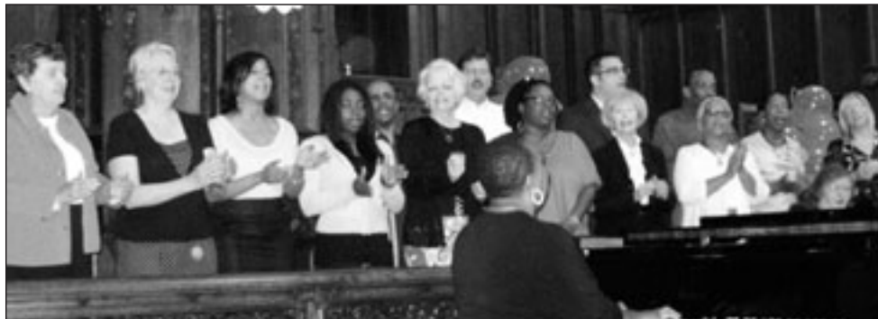
On Sunday, May 22, the Gospel Choir led worship with the anthem "Holy, Holy, Holy" and offertory "I Love You Lord Today."