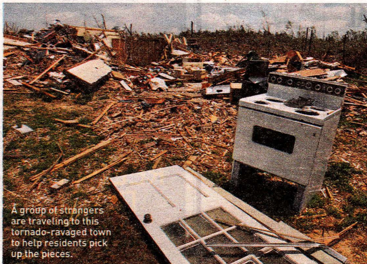
A group of strangers are traveling to this tornado-ravaged town to help residents pick up the pieces.

One of them, a 38-year-old writer from Brooklyn, first heard of the town—named for a railroad engineer—in 1993 during an episode of TV's Hee Haw . The next year, while visiting Huntsville, Ala., he took