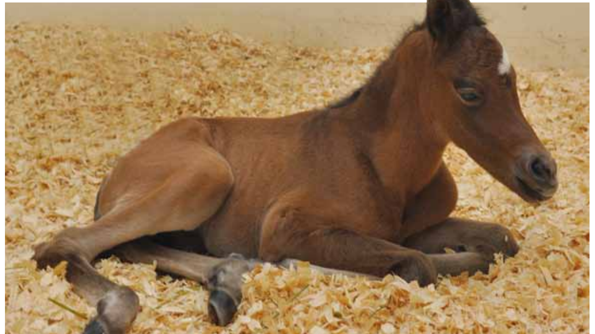
The colt, which is named Mirsal Al Shaqab, was born at 10am on 18 January.