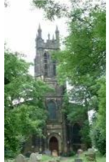
Christ Church, Coseley

Next came a short meeting, where we were informed of forthcoming events for the