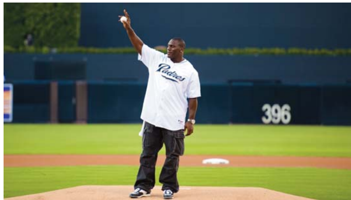
Takeo Spikes