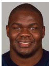
DE TOMMIE HARRIS

6-3, 295 Oklahoma 8th NFL Season 1st with Chargers Free Agent - '11 Ellison HS Killeen, Tex.