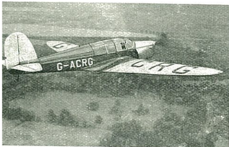
A BRITISH KLEMM EAGLE