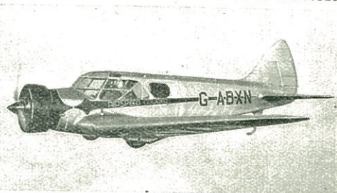
AIRSPED COURIER, WITH RETRACTABLE WHEELS