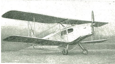
A DE HAVILLAND FOX MOTH