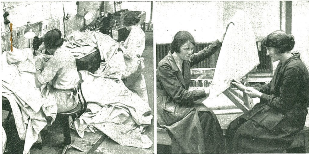
Many thousands of yards of the finest Irish linen are used for the coverings of wings and other surfaces in a big aeroplane factory in the course of a year. On the left fabric is being prepared for wings, and on the right a tail plane is being covered.