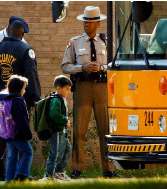
Law enforcement's role in public safety ranges from safe guarding our schools to patrolling the sky.

STUDENTS WILL GAIN A DEEPER APPRECIATION FOR THE DUTIES POLICE OFFICERS AND DEPUTY SHERIFFS PERFORM TO PROTECT OUR COMMUNITIES IN TIMES OF EMERGENCY.