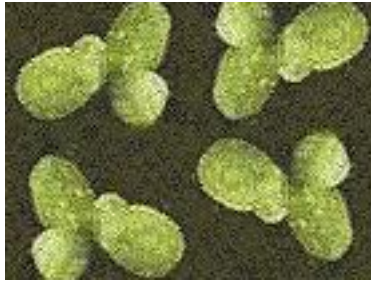
Duck weed-Lemna minor