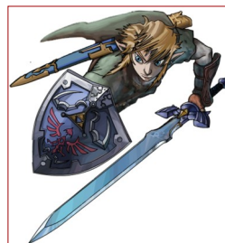
Vector art- ICT excellence on Moodle

Watch out for Mr Joe Bell's ICT Showcase page highlighting examples of these. In Y10 and Y11 students follow a KS4 ICT course (OCR Nationals) which is