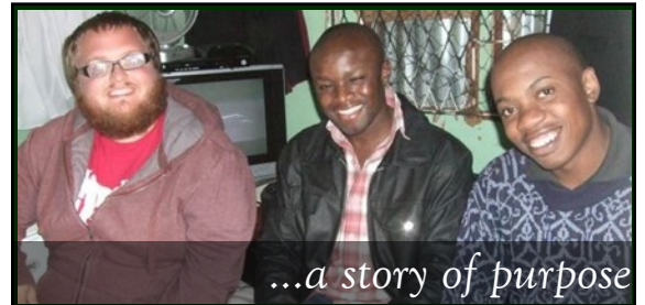
...a story of purpose