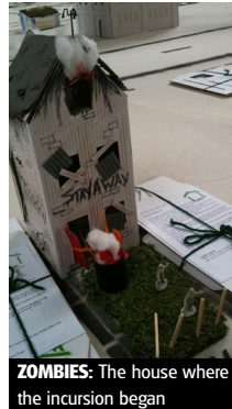
ZOMBIES: The house where the incursion began

Other homeowners said they had invited the zombies round for tea, and the