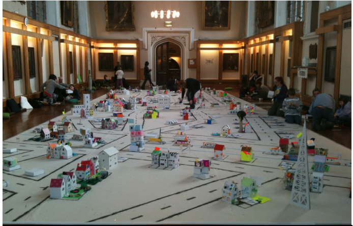
HOME SWEET HOME: Cardboard city grows at Blackfriars Hall

The castle, a church, a pub, the Norfolk and Norwich Festival Spiegelent and the radio mast allowing Residents