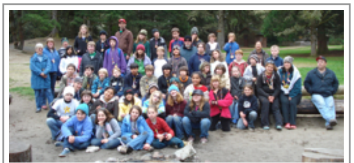
OMSI Camp 5th Grade, 2009

Contact: Call Multnomah ESD: 503-257-1732 Email to: speterso@mesd.k12.or.us Website: www.mesd.k12.or.us/shs/childhealth/indexnew.shtml